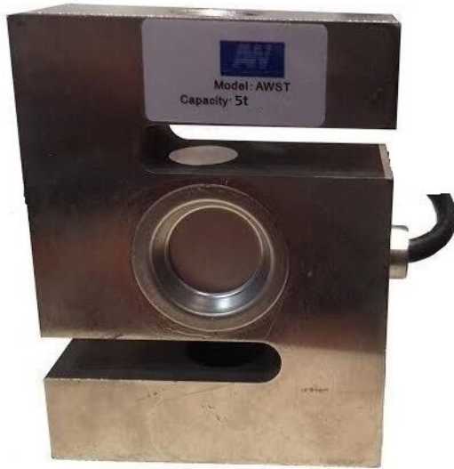
AWST Load cell