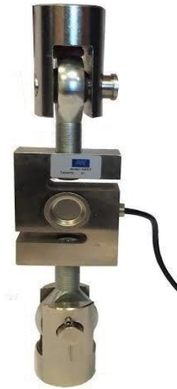
AWST Load cell with accessories (Optional)